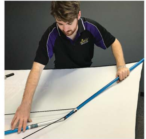
Unfolding last arm stretches fabric tight