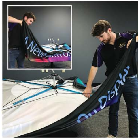
Unfold remaining arms locking the sliders