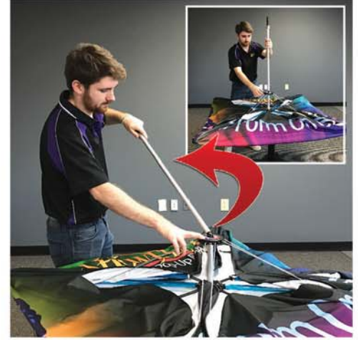
Pivot telescoping leg 90° to lock hub.