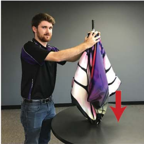
Set ShowFlex upright on table