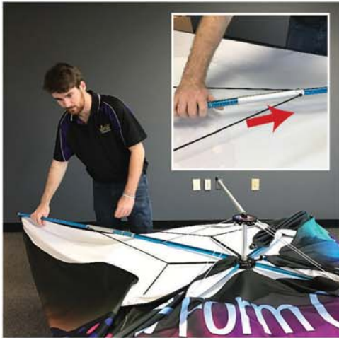
Unfold arms and lock spring loaded sliders