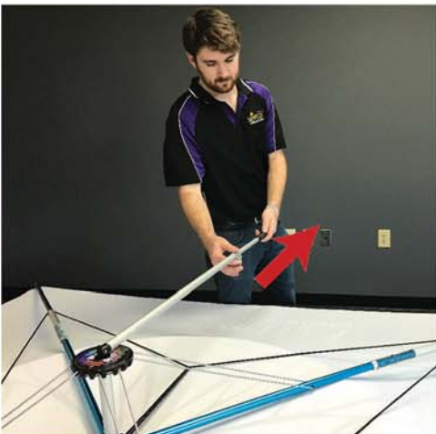
Extend the telescoping leg