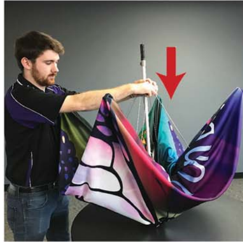
Unfold unit by pushing hub toward table