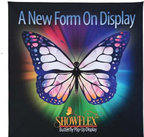
Ready to show! Patent Pending

IMPORTANT: Pivot telescoping leg 90 degrees to lock the hub in place BEFORE unfolding the arms of the ShowFlex.